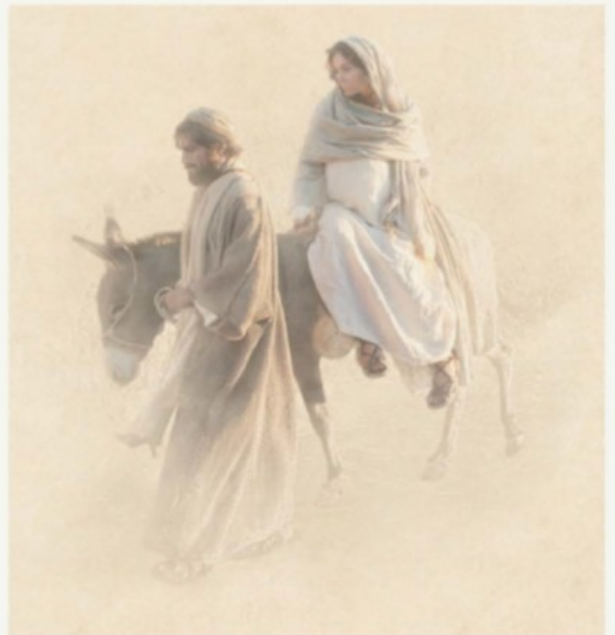
The Donkey Prayer To Saint Joseph